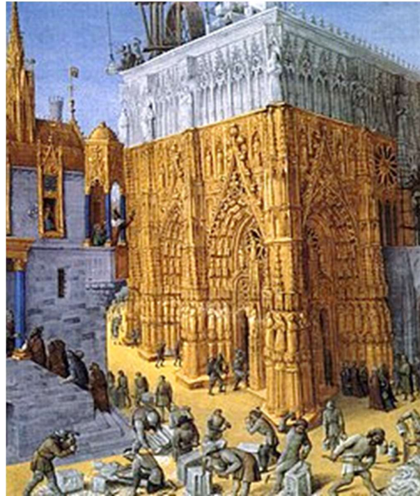
The Building of the Temple Jean Fouquet (c1465)

“Think of the positive: of the calling, in the present, to share in the surprising hope of God’s whole new creation. The image I have often used, in trying to explain this strange but important idea, is that of the stonemason working on part of a great cathedral. The architect has already got the whole plan in mind, and has passed on instructions to the team of masons as to which stones need carving in what way. The foreman distributes these tasks among the team. One will shape stones for a particular tower or turret; another will carve the delicate pattern that breaks up the otherwise forbidding straight lines; another will work on gargoyles or coats of arms; another will be making statues of saints, martyrs, kings or queens. They will be vaguely aware that the others are getting on with their tasks; and they