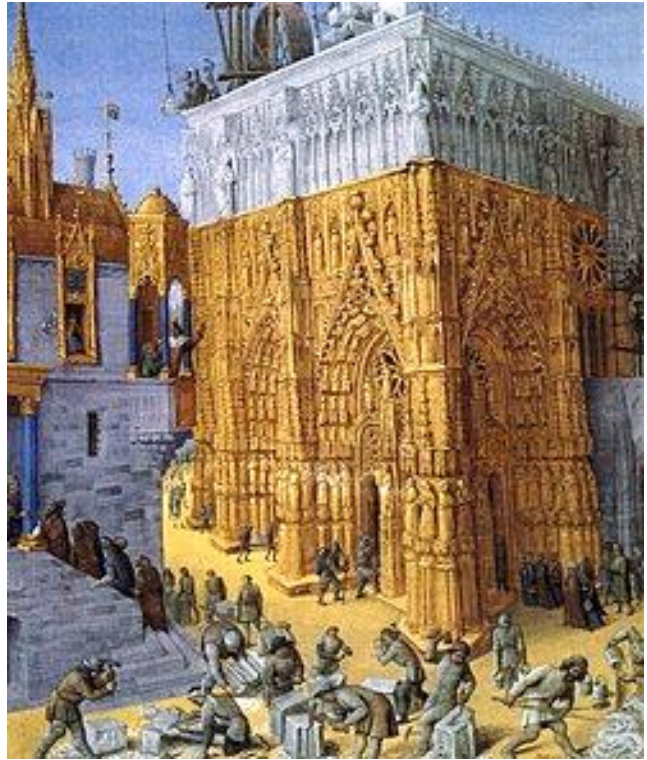
The Building of the Temple Jean Fouquet (c1465)

“Think of the positive: of the calling, in the present, to share in the surprising hope of God’s whole new creation. The image I have often used, in trying to explain this strange but important idea, is that of the stonemason working on part of a great cathedral. The architect has already got the whole plan in mind, and has passed on instructions to the team of masons as to which stones need carving in what way. The foreman distributes these tasks among the team. One will shape stones for a particular tower or turret; another will carve the delicate pattern that breaks up the otherwise forbidding straight lines; another will work on gargoyles or coats of arms; another will be making statues of saints, martyrs, kings or queens. They will be vaguely aware that the others are getting on with their tasks; and they